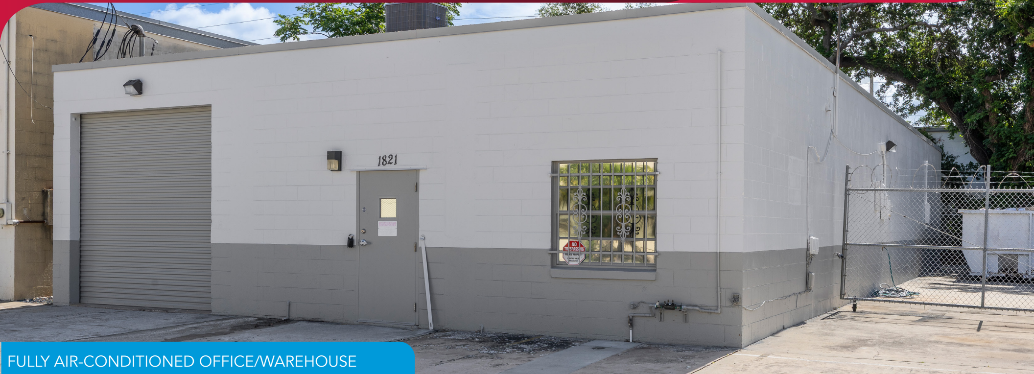
FULLY AIR-CONDITIONED OFFICE/WAREHOUSE