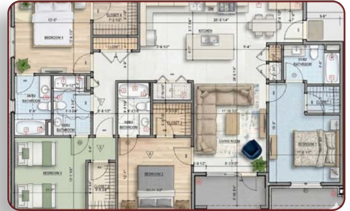
4 BEDROOM 1,692 SF

The approved floor plans offer a range of options, from efficient 2-bedroom (1,075 SF) layouts to expansive 3 and 4-bedroom (1,692 SF) family homes. Each design features an open-concept flow that perfectly balances social living with private retreats. With a focus on natural light and functional space, these homes are built to adapt to lifestyle, offering the ideal mix of comfort and contemporary design.