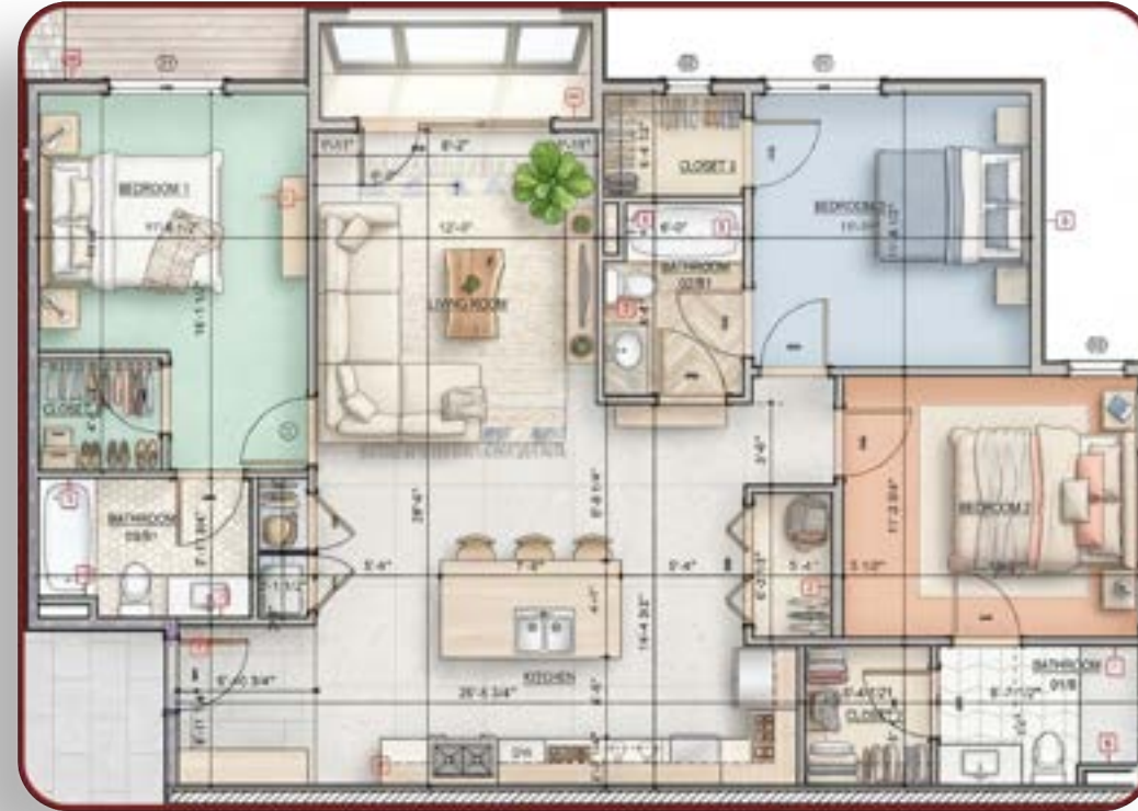
3 BEDROOM 1,350 SF