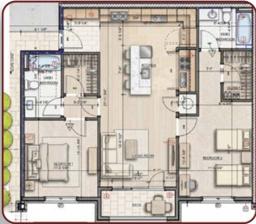
2 BEDROOM 1,075 SF