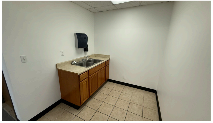
WET BAR/BREAK AREA