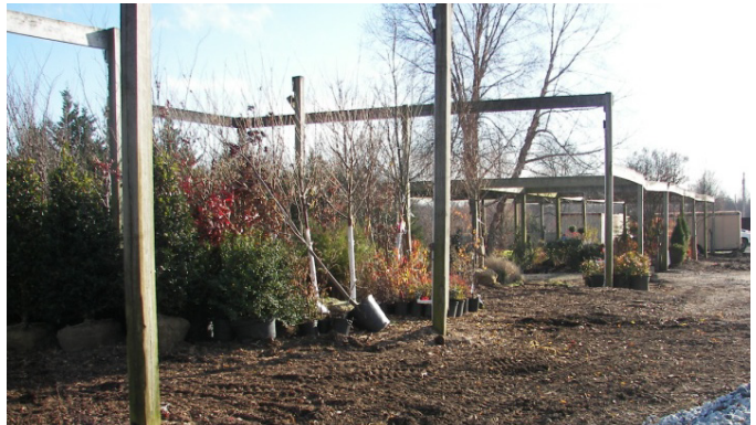
Irrigated Plant Holding Area