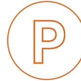
Shared loading and parking