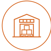
Level access loading