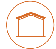
Steel portal frame construction