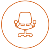
Ground floor offices and amenities