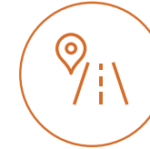
Popular estate in Warrington