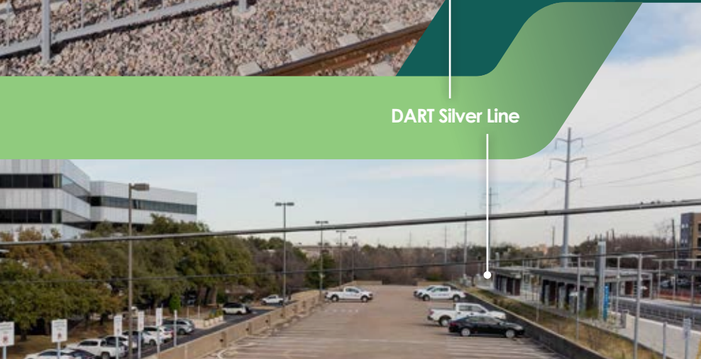
DART Silver Line