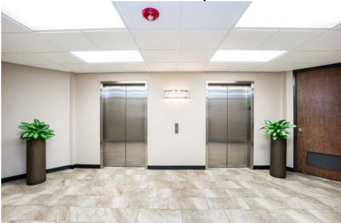
Second Floor Hallway