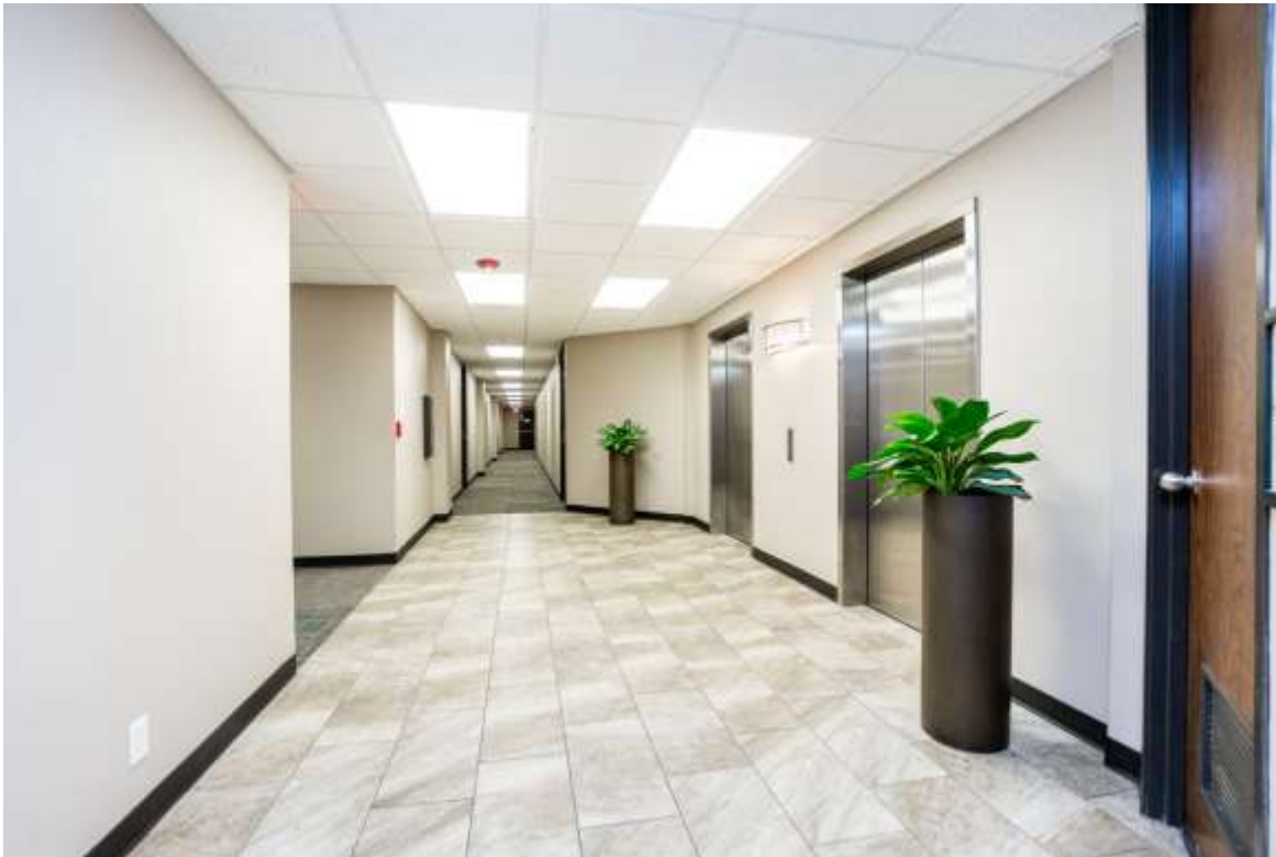
Second Floor Atrium