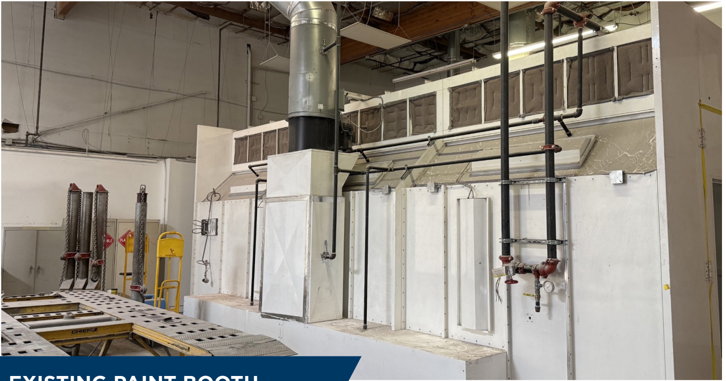
EXISTING PAINT BOOTH