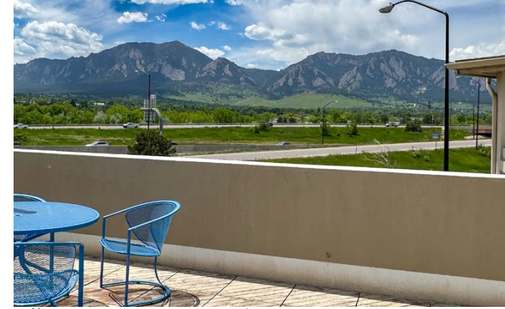
All Tenant Access Patio

Suites are available. Suites are leased at triple net rates starting at $14.50/sq.ft. and Individual Offices are offered at gross rates including all expenses with access to shared waiting areas, full kitchen, and patio areas. Please inquire about suites.