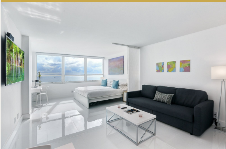
Ocean-View Living Space