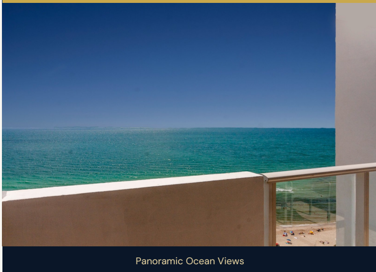
Panoramic Ocean Views