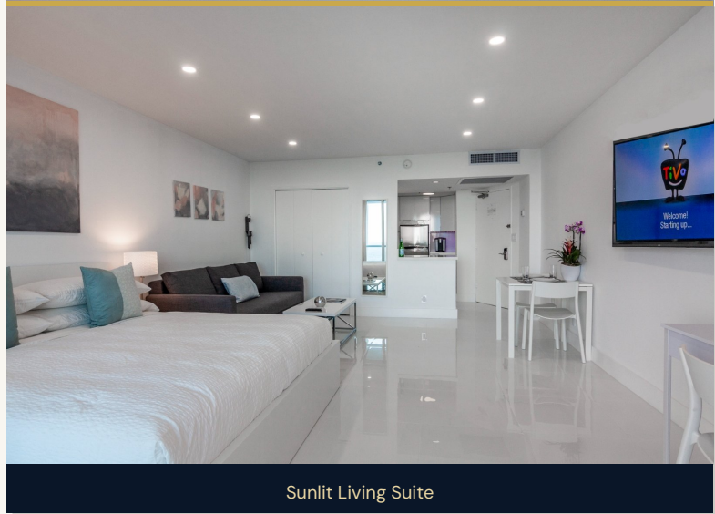
Sunlit Living Suite