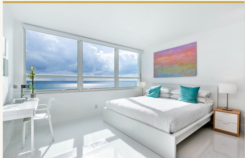
Oceanfront Master Bedroom