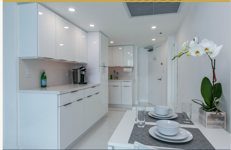
Modern Gourmet Kitchen