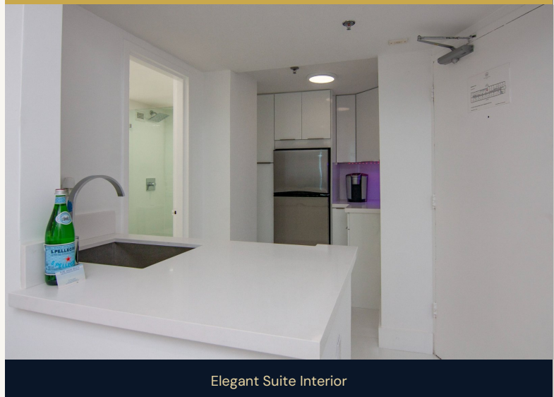
Elegant Suite Interior