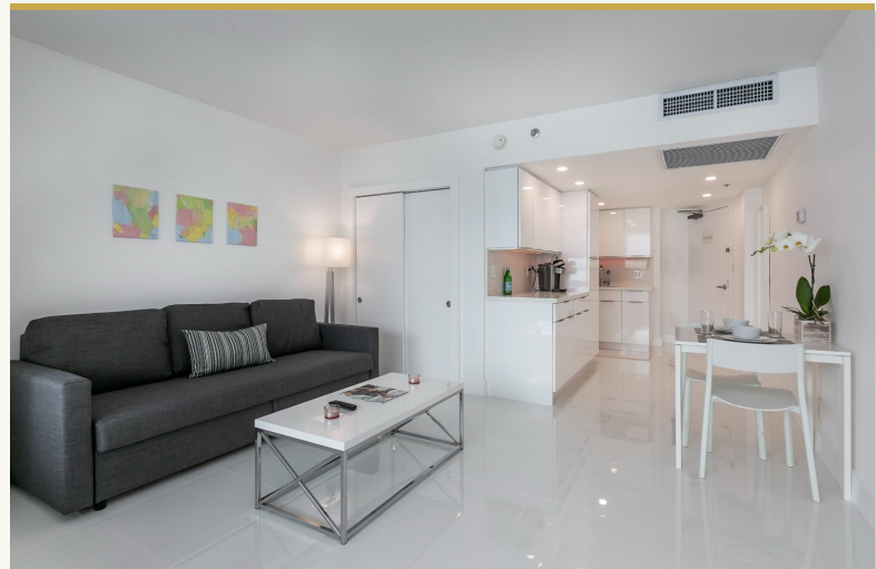
Contemporary Living Area