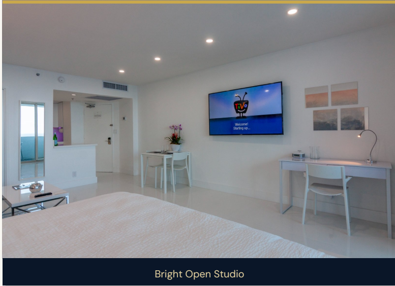
Bright Open Studio