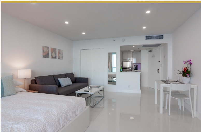
Chef's Kitchen & Dining