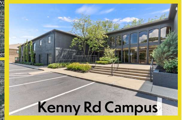
Kenny Rd Campus