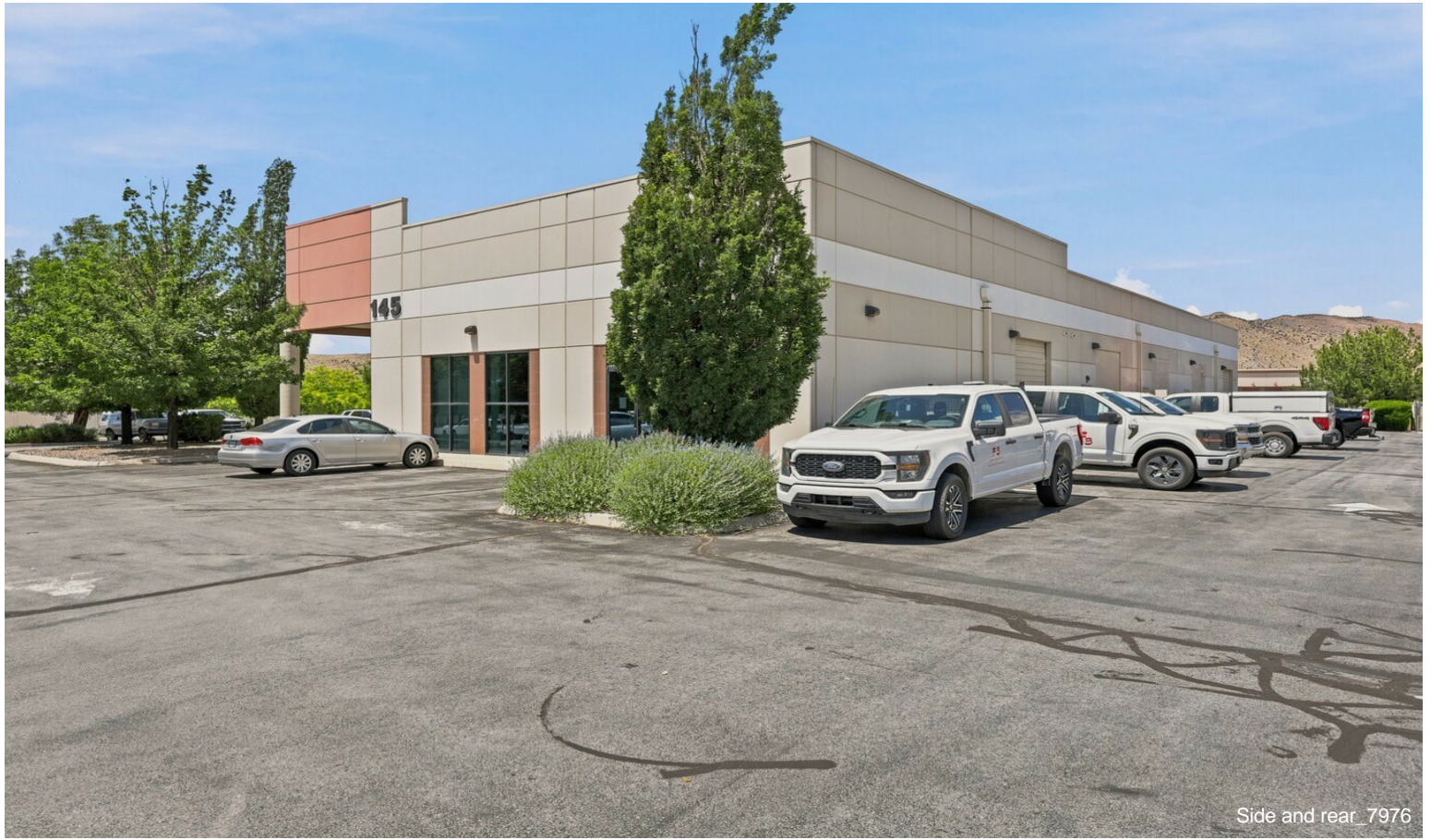
Side and rear_7976