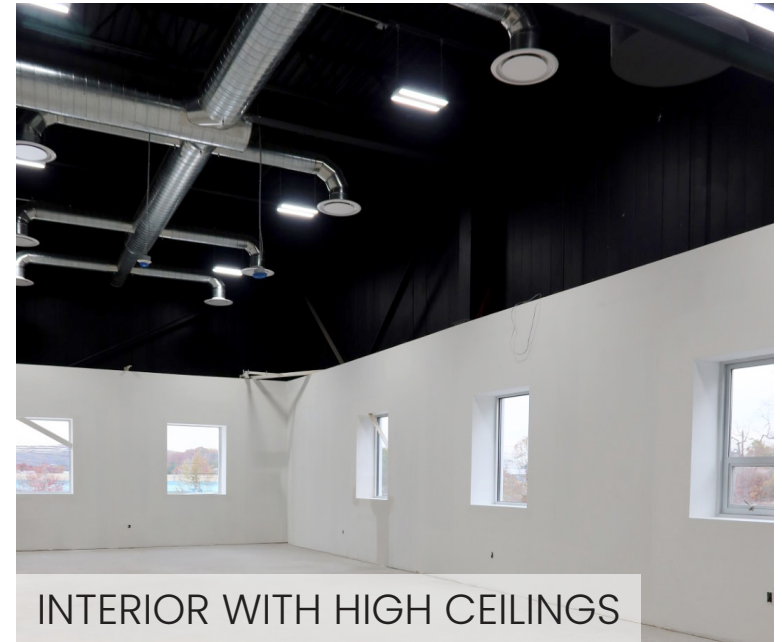
INTERIOR WITH HIGH CEILINGS