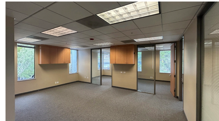
FLOOR PLAN NOT TO SCALE