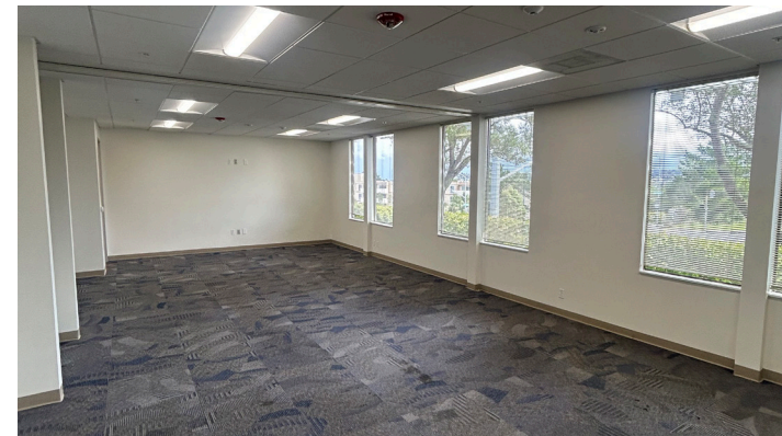
FLOOR PLAN NOT TO SCALE