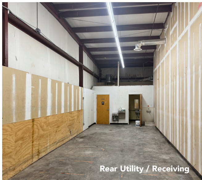
Rear Utility / Receiving