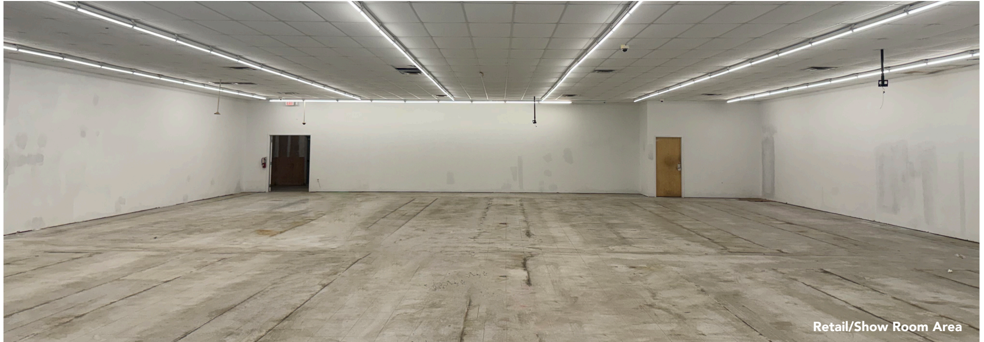
Retail/Show Room Area