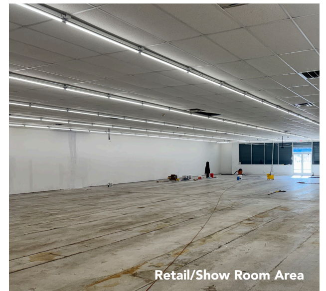
Retail/Show Room Area