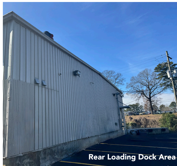
Rear Loading Dock Area