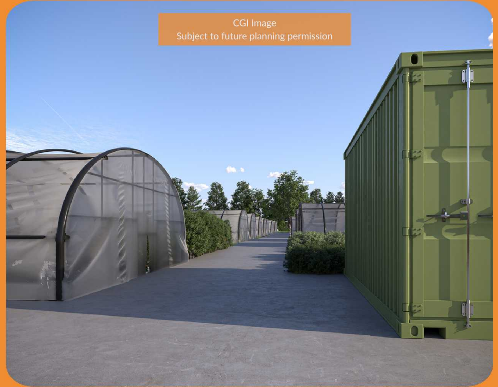
CGI Image Subject to future planning permission

Mains water and electricity is connected to the site, but does not extend to all areas.