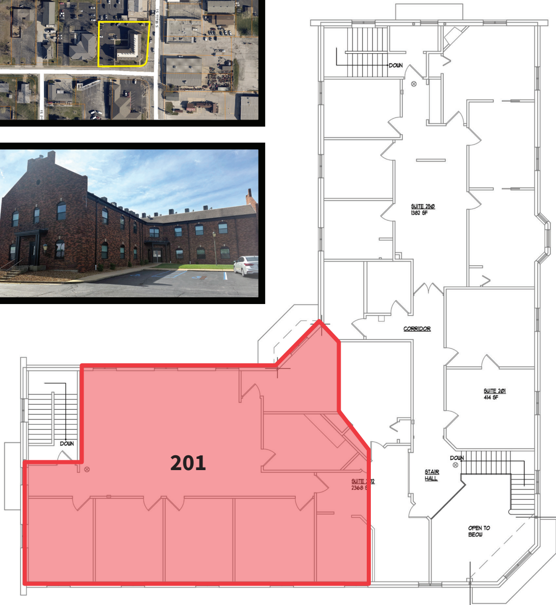
SECOND FLOOR PLAN SCALE: 1/8" = 1'-0"