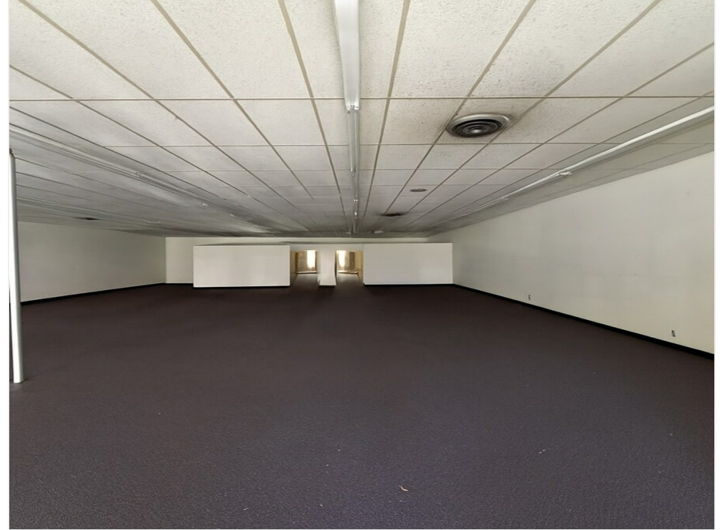
IMG_5828 - Remove --all-- furniture, de...