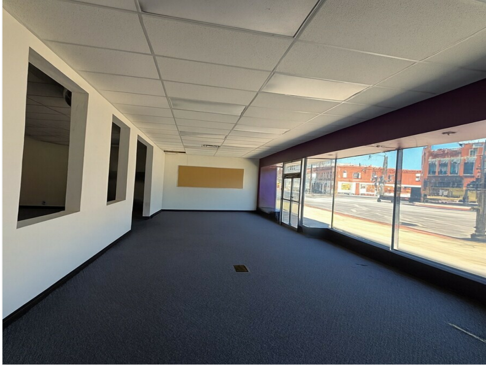
IMG_5842 - Remove --all-- furniture, de...