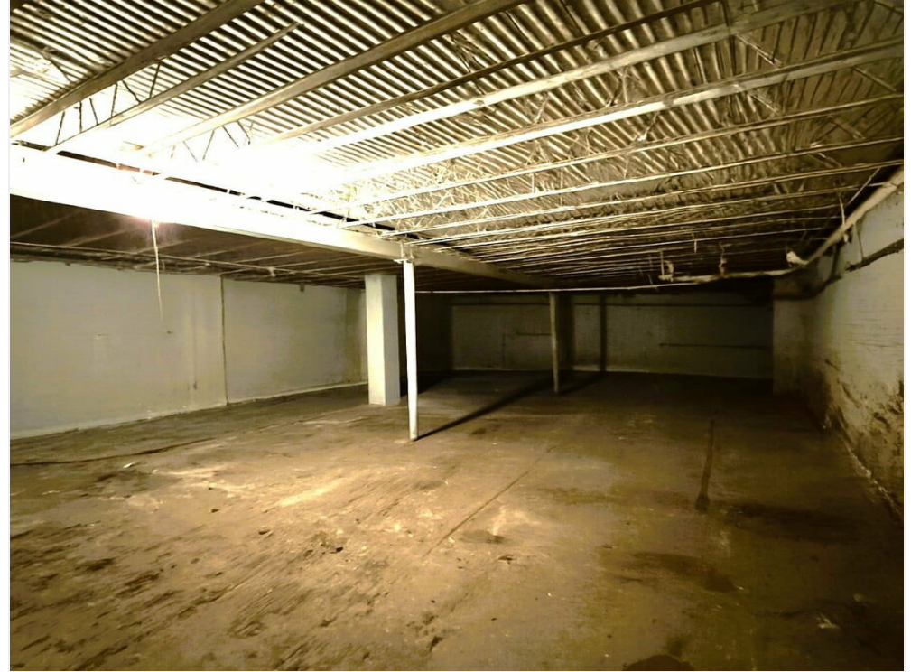
IMG_5833 - Remove --all-- furniture, de...