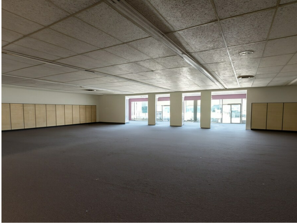
IMG_5841 - Remove --all-- furniture, de...