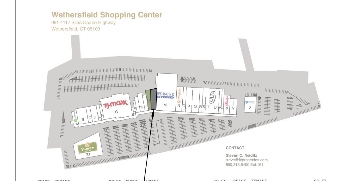
VICINITY MAP SCALE: NOT TO SCALE