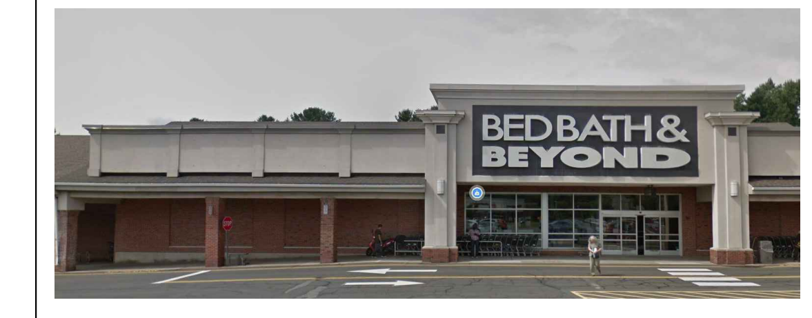
EXISTING STOREFRONT SCALE: NOT TO SCALE

PRELIMINARY DRAWING SUBJECT TO FIELD VERIFICATION