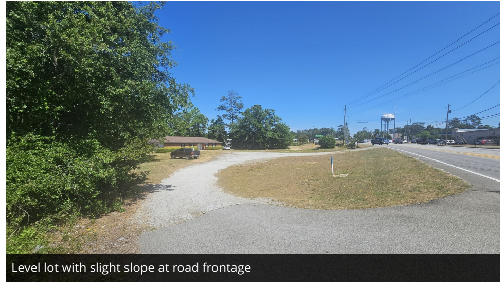
Level lot with slight slope at road frontage