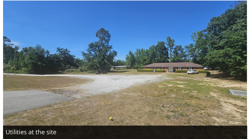
Utilities at the site