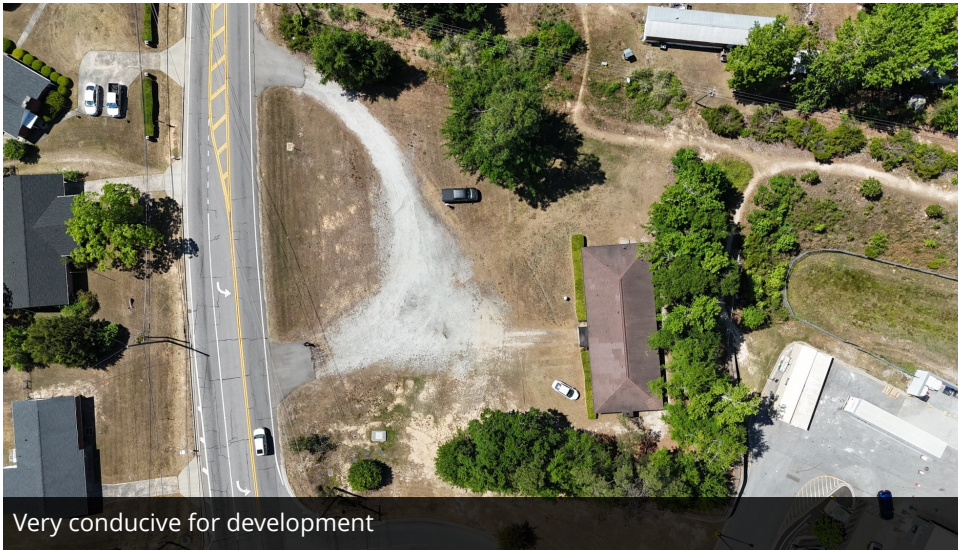
Very conducive for development