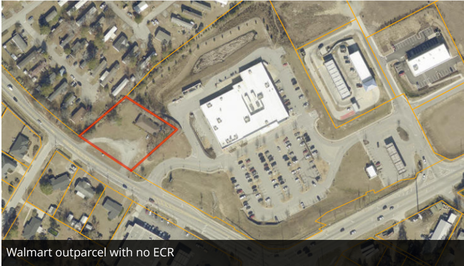
Walmart outparcel with no ECR