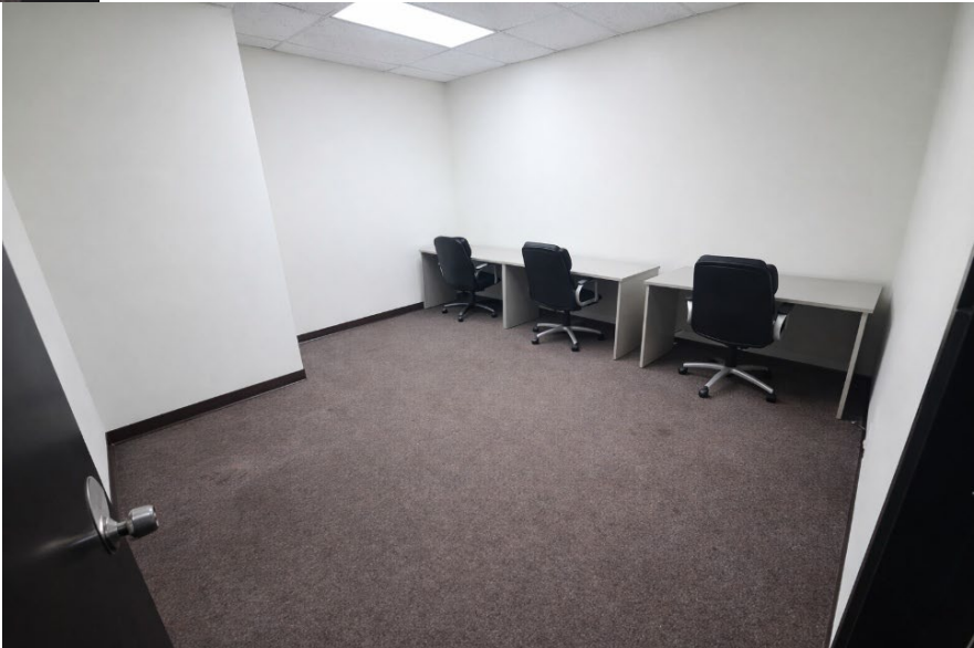
200F - 155 RSF