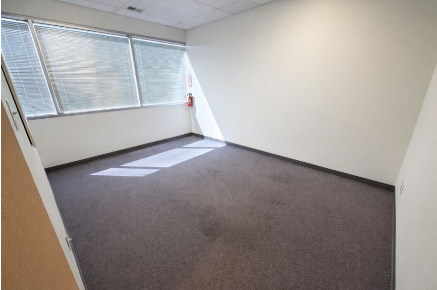
200D - 165 RSF