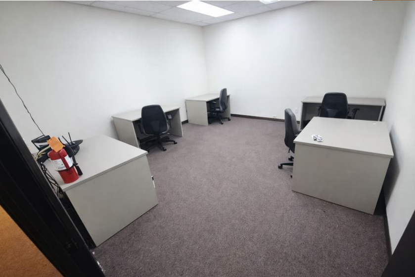
200E - 252 RSF