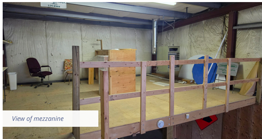
View of mezzanine