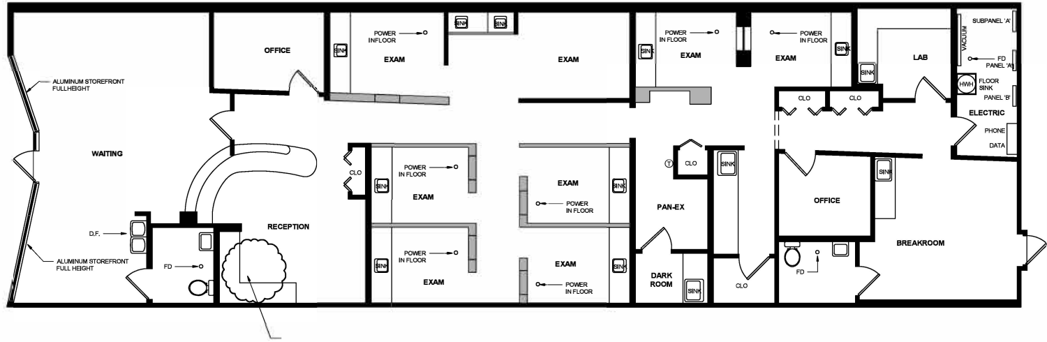
1 A1-1 EXISTING FLOOR PLAN Scale: 1/4" = 1'-0" 3,100 NET S.F.

LEGEND OF WALLS FULL HEIGHT WALLS PARTITIONS UP TO 8'-0" AFF.