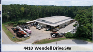
4410 Wendell Drive SW