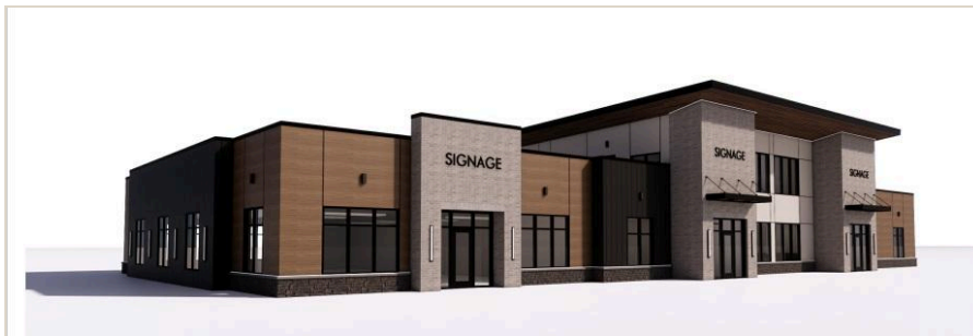
BUILDING EXTERIOR – FRONT ELEVATION