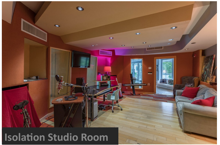
Isolation Studio Room