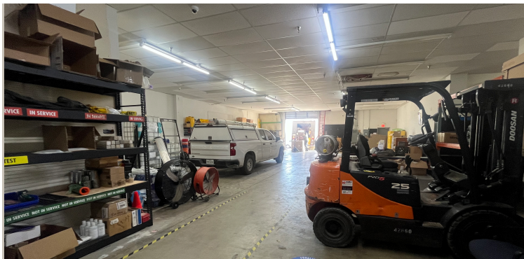
WAREHOUSE / FLOOR