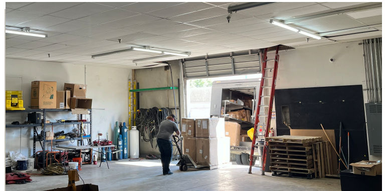
RAMPED DRIVE-IN DOOR