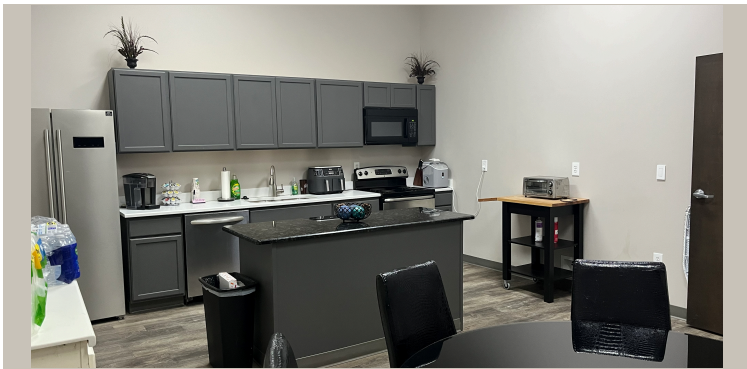
KITCHONETTE / BREAK AREA