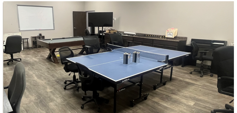
GATHERING / RECREATION ROOM