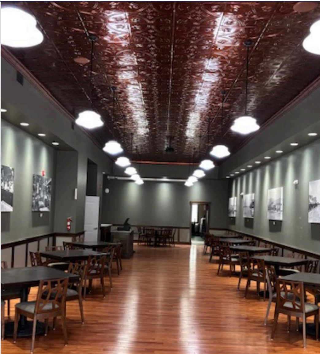
Potential 2nd restaurant venue with separate exterior entrance/ was used as a banquet room.