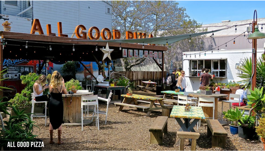
ALL GOOD PIZZA