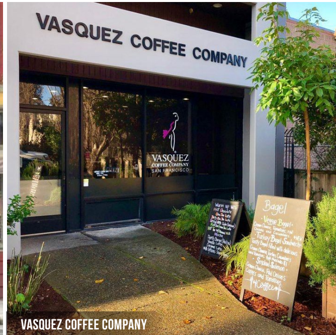
VASQUEZ COFFEE COMPANY