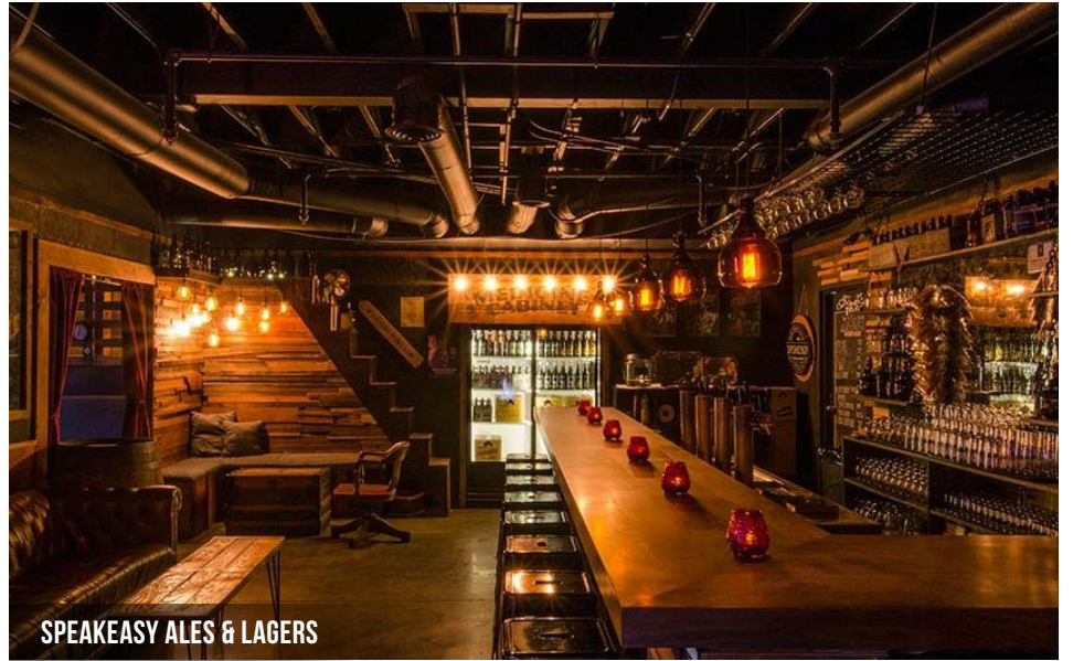
SPEAKEASY ALES & LAGERS