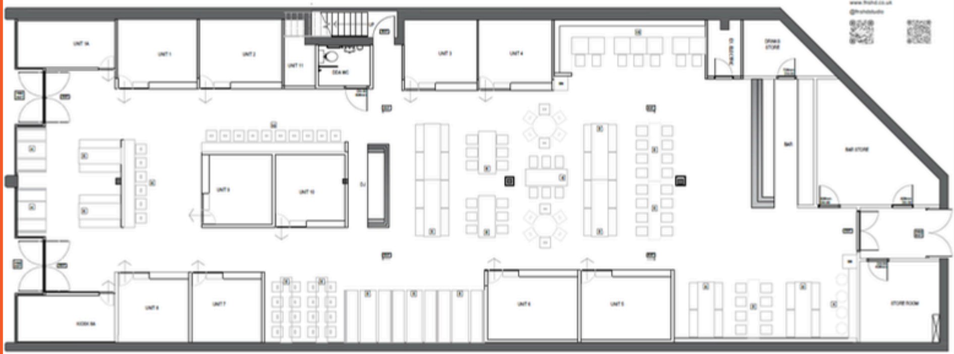
FLOOR PLAN Scale: 1:500