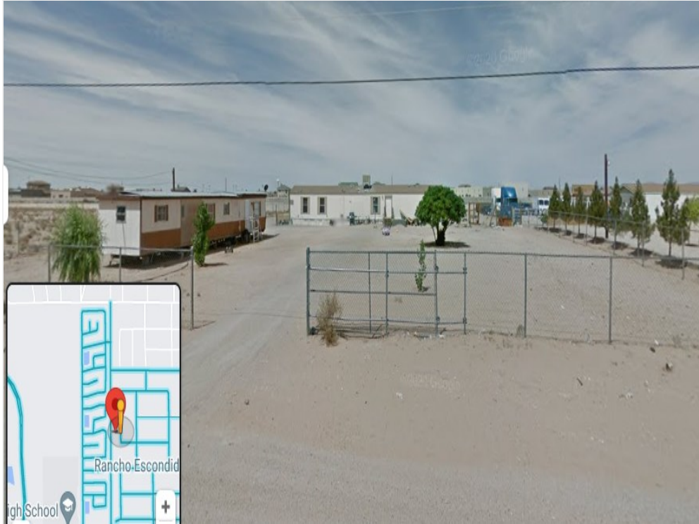
Front + location pin