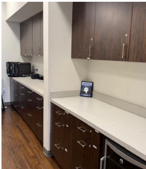
Built-ins with coffee bar