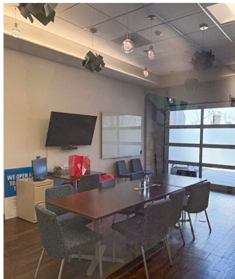
Glassed-in conference room