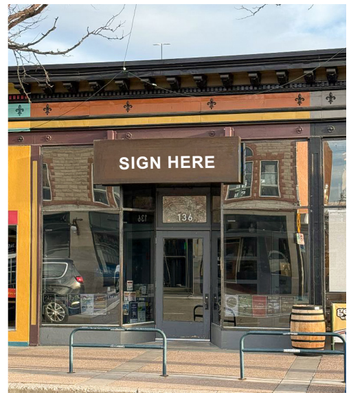
West Mountain Avenue Frontage