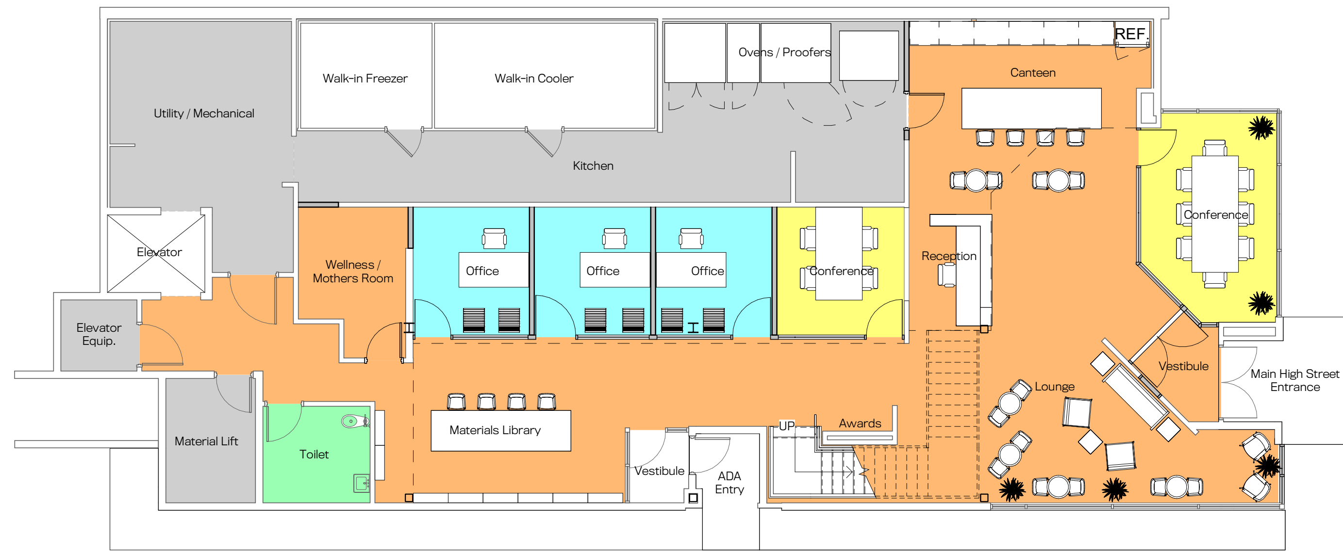
① First Floor Plan 1/8" = 1'-0"