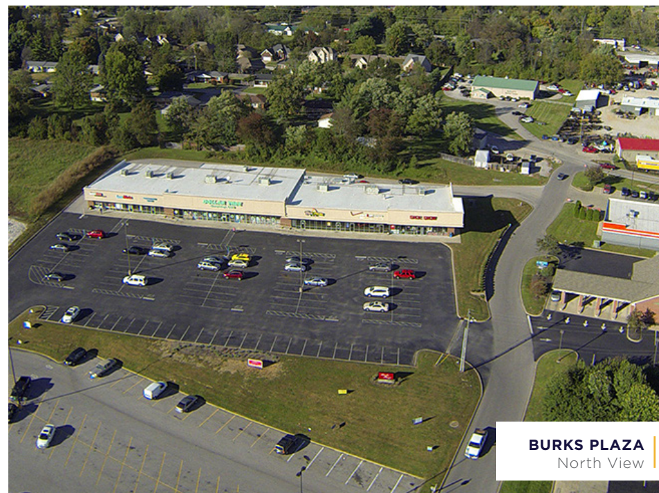
BURKS PLAZA North View