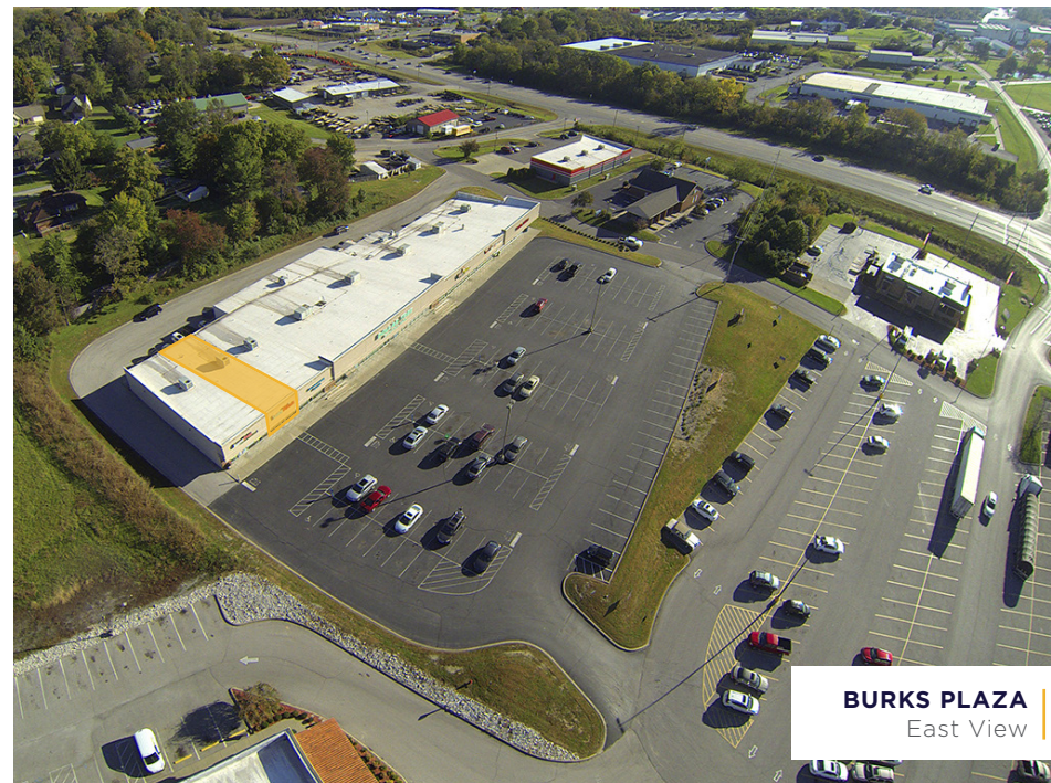
BURKS PLAZA East View