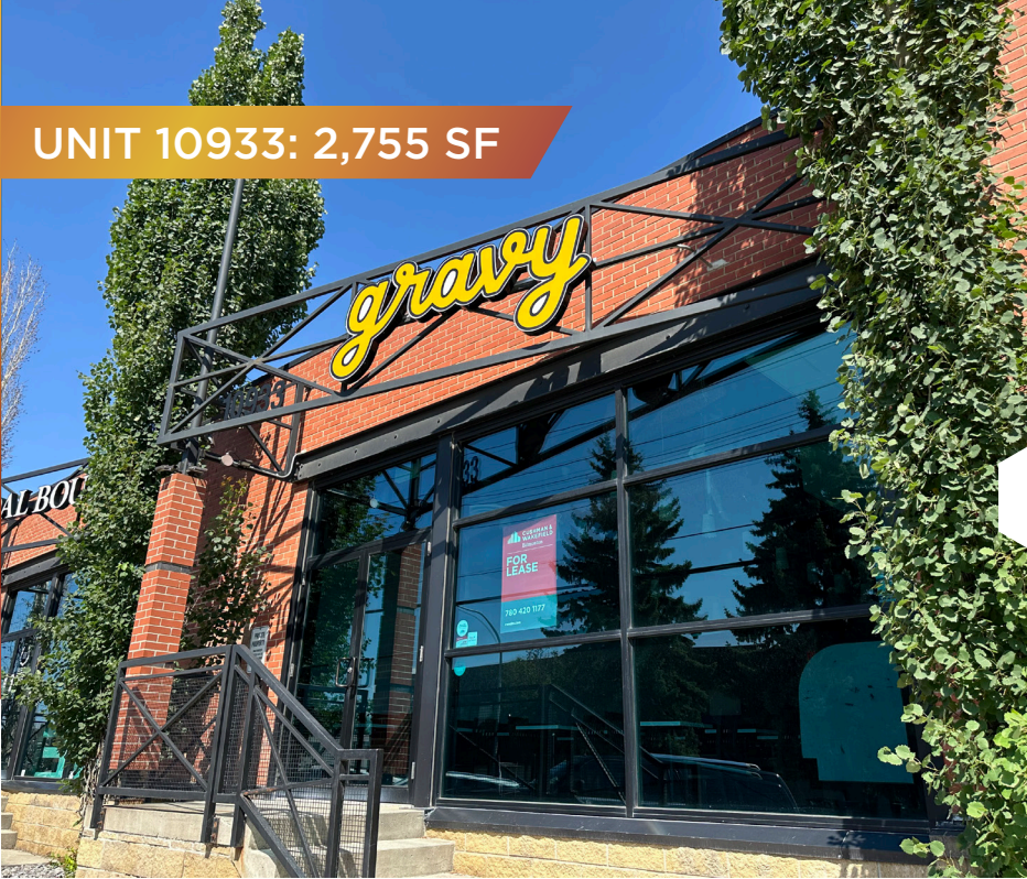
UNIT 10933: 2,755 SF