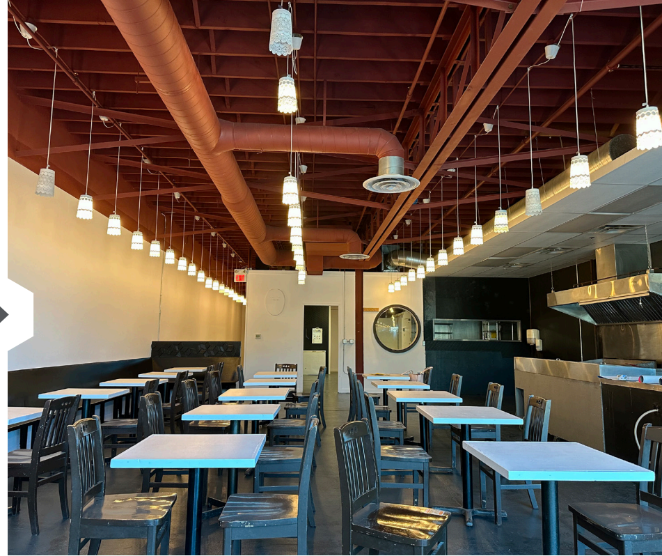
UNIT 10930: 3,238 SF