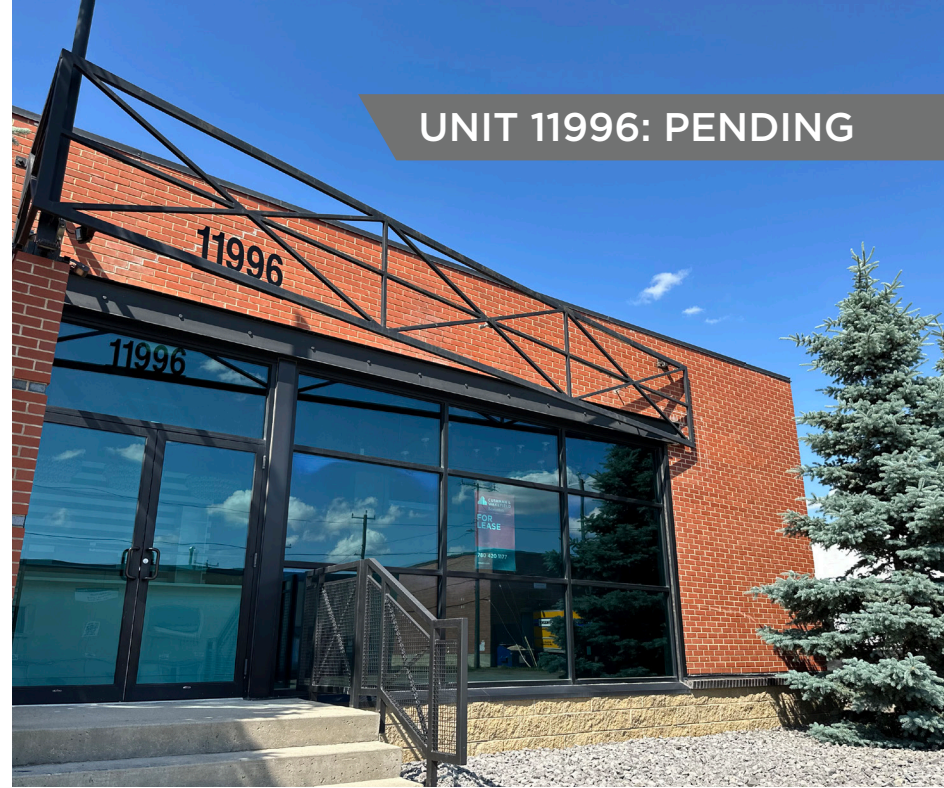
UNIT 11996: PENDING