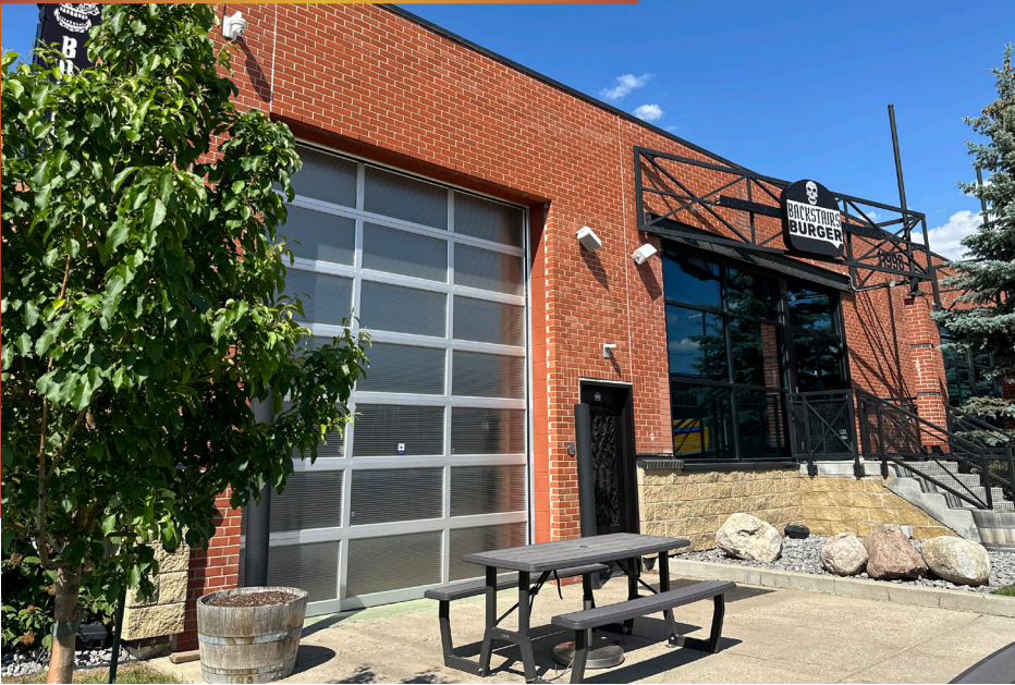
UNIT 11998: LEASED!