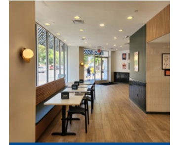
Wonder Interior View

Recently signed at the building and in the vicinity: Wonder, CityMD; Sunnyvale Physical Therapy; The Dermatology Specialists; Health First, Prime Care Chemists, UPS, and Sterling Optical