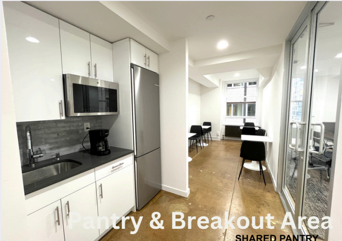
Pantry & Breakout Area