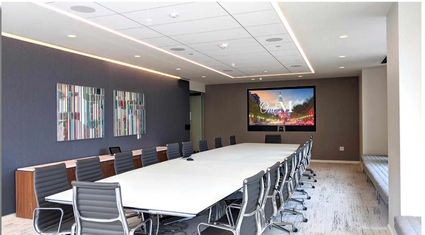
Full Video Conferencing Capabilities