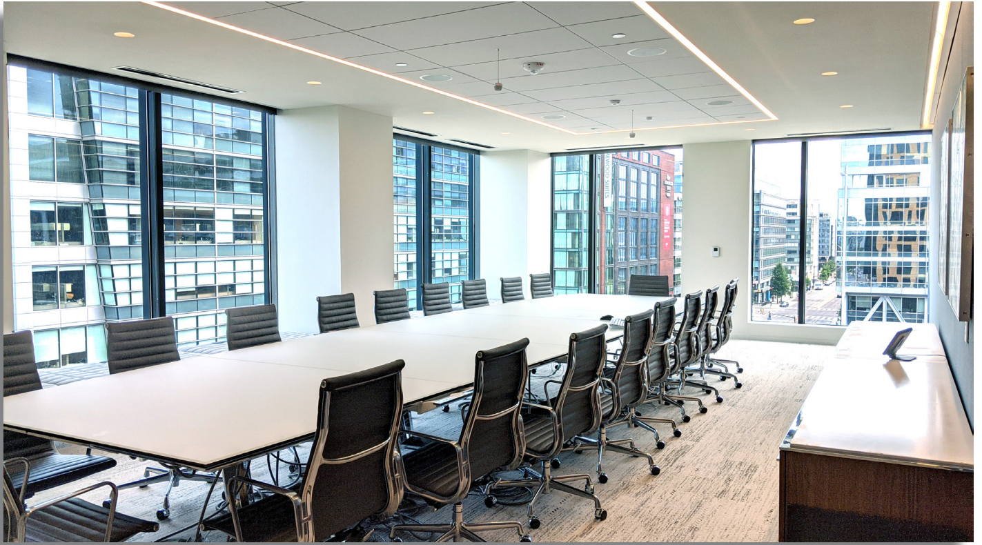
Facing M Street