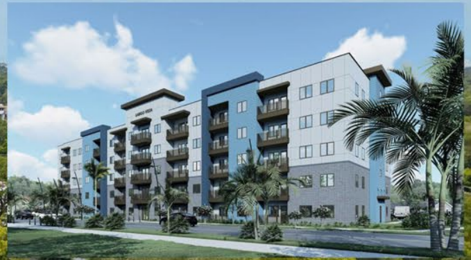
Largo Vista Apartments | Largo, FL