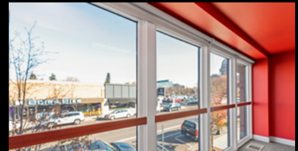
±2,328 SF AVAILABLE