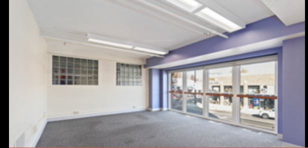
SUITE M 100

Vacant with immediate occupancy available. Contact agents for showing instructions.