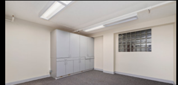
$17.00 PSF FSEJ