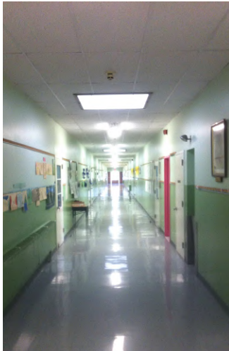
Clean, bright halls