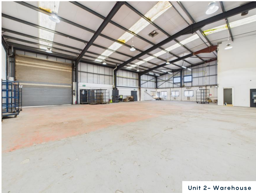
Unit 2- Warehouse