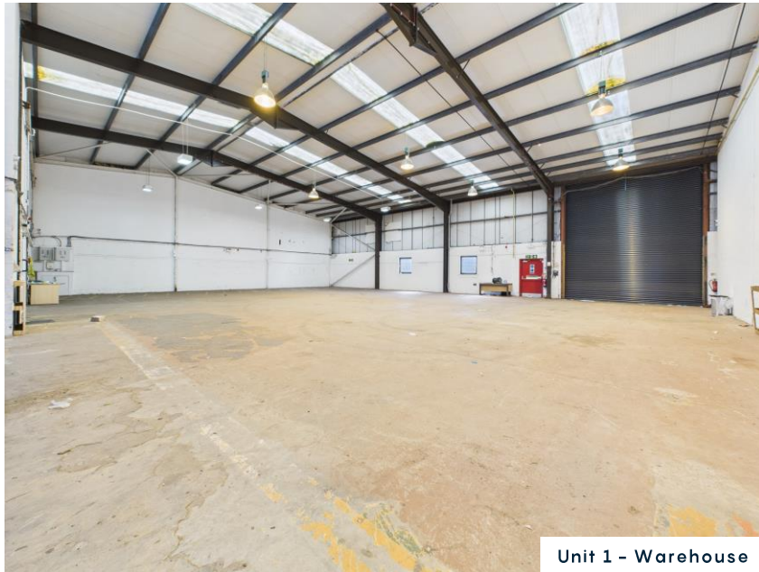
Unit 1 - Warehouse