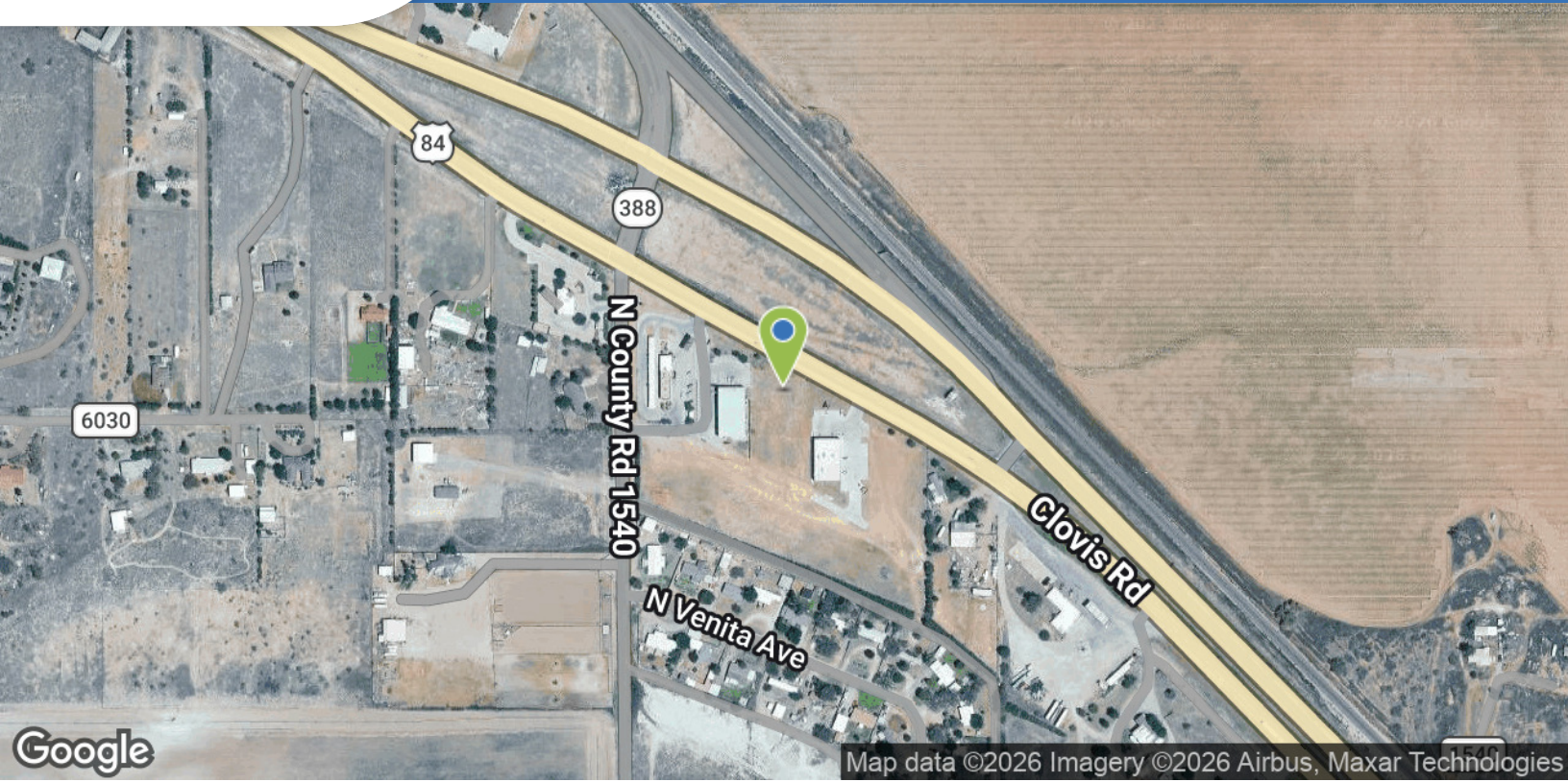
Map data ©2026 Imagery ©2026 Airbus, Maxar Technologies