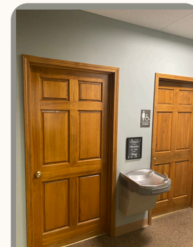
Two Private Restrooms