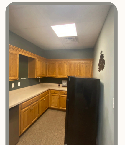
Mini Kitchen/Coffee Bar