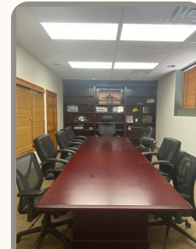
Corporate Meeting Room