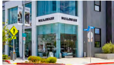
WOLF & BADGER