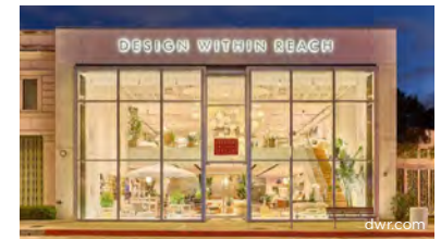
DESIGN WITHIN REACH

The information contained herein has been obtained from sources deemed reliable but has not been verified and no guarantee, warranty or representation, either express or implied, is made with respect to such information. Terms of sale or lease and availability are subject to change or withdrawal without notice.