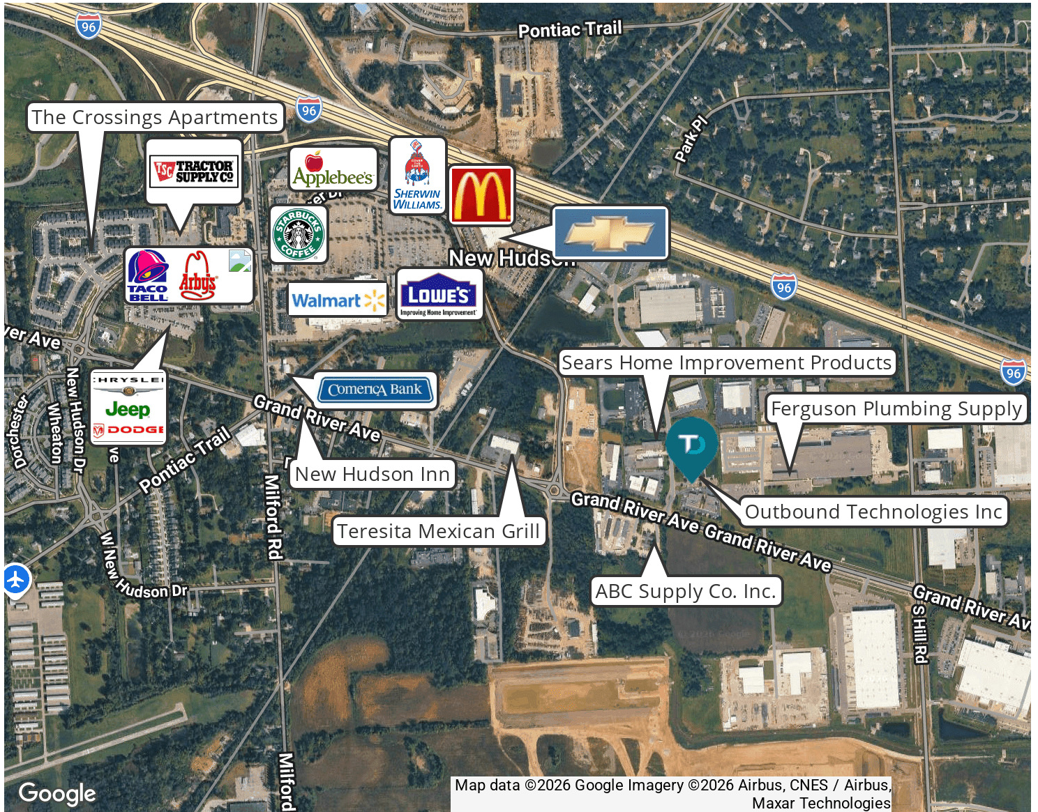
Map data ©2026 Google Imagery ©2026 Airbus, CNES / Airbus, Maxar Technologies