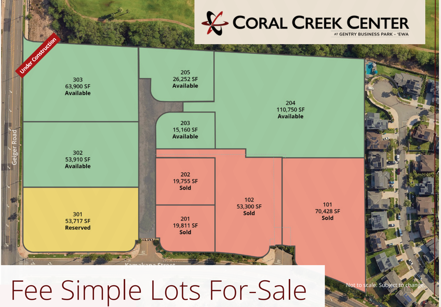
Not to scale. Subject to change.