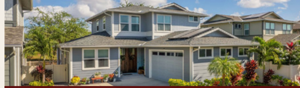
Coral Ridge by Gentry