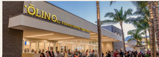
Ka Makana Ali'i