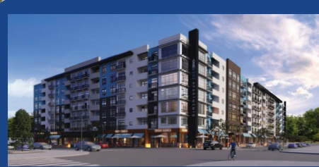
1 W ELIZABETH AVENUE