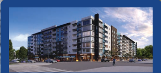
1 W ELIZABETH AVENUE