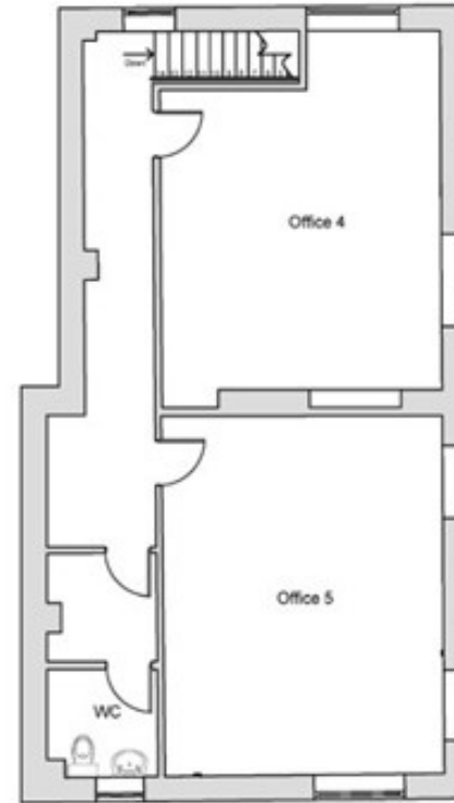
Existing Ground Floor Plan 1:100