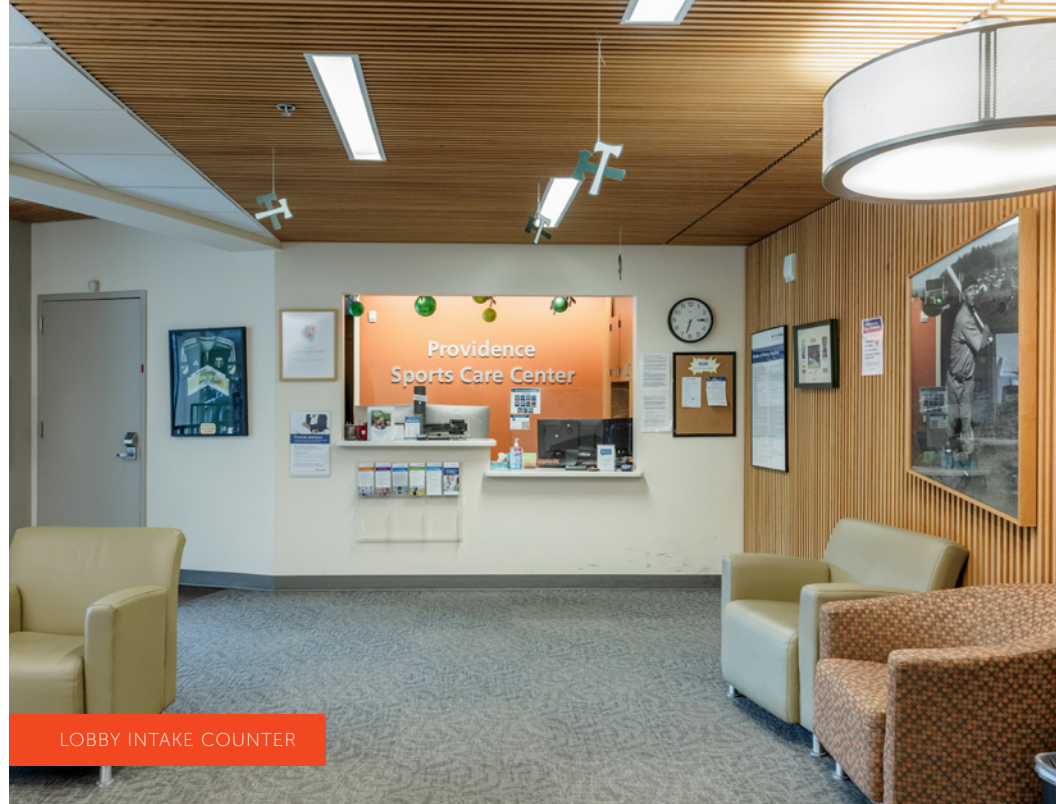
LOBBY INTAKE COUNTER