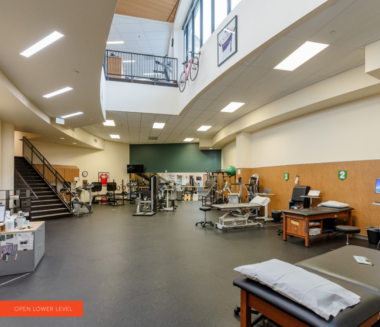
OPEN LOWER LEVEL