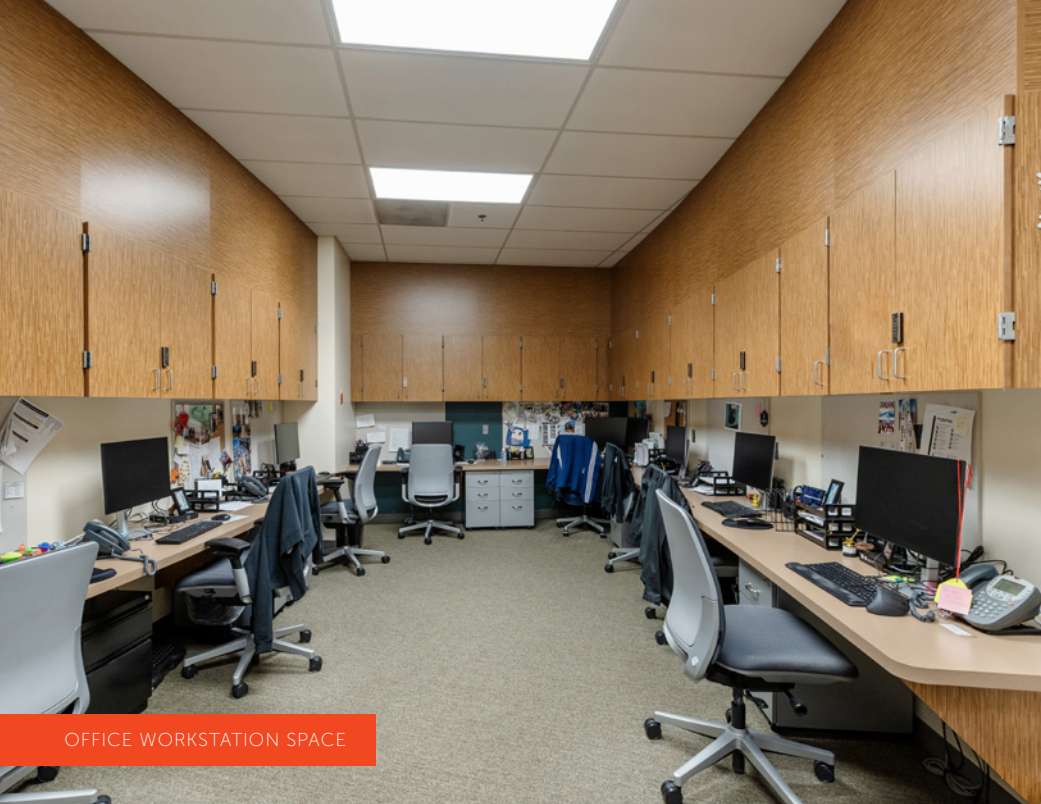
OFFICE WORKSTATION SPACE